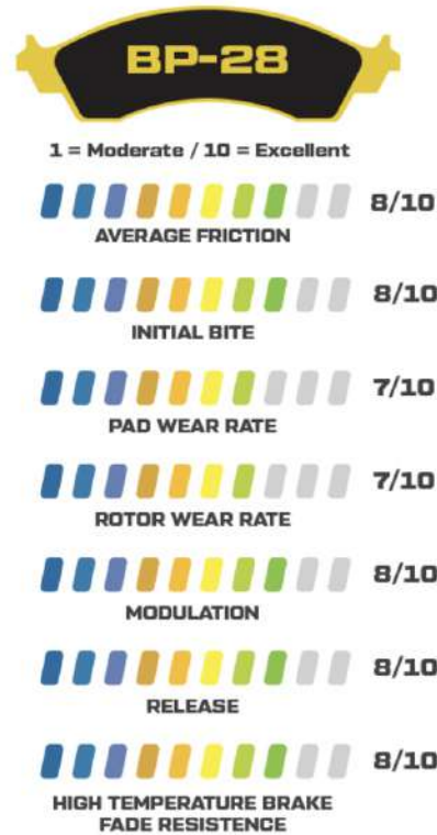
BP-28 Performance Stats